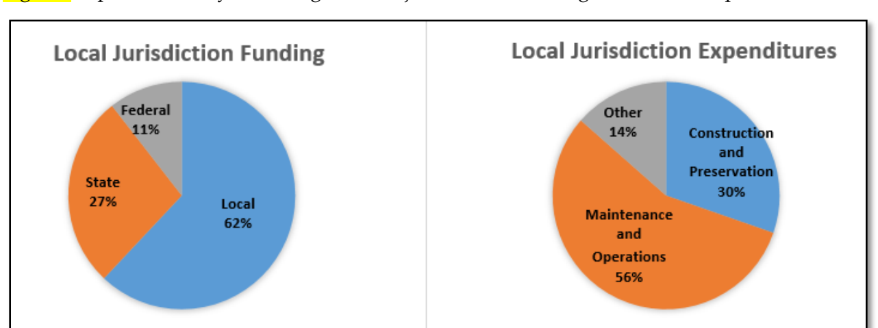
Figure_ depicts the five-year average of local jurisidiction funding sources and expenditures.