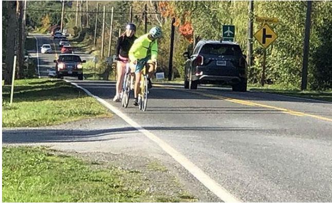
The lack of bike lanes and sidewalks – as well as inadequate or non-existent shoulders – makes bicycling and walking hazardous in many locations along Marine Drive.

on the north shore of Bellingham Bay from Bellingham and crosses the Nooksack River delta on its way to the Lummi Nation. This project between Locust Avenue and Alderwood Drive is the second of a three-phase project to improve bicycle and pedestrian safety from the Bellingham city limits across the BNSF railway. (Additional information can be found here .) Request: $2.5-million