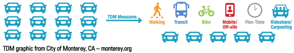
TDM graphic from City of Monterey, CA – monterey.org

In partnership with the Whatcom Transportation Authority (WTA), regional business, local governments,