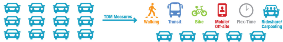
TDM graphic from City of Monterey, CA – monterey.org

In partnership with the Whatcom Transportation Authority (WTA), regional business, local governments,