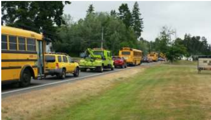
Traffic backed up on State Route 548 due to VACIS inspection.

Grade Separation Rail-Traffic Solution at State Route 548 (Blaine) – The U.S Department of Homeland Security's "VACIS" rail freight-car inspection array is located alongside BNSF Railway's tracks immediately south of the City of Blaine's southern limit. While the VACIS is in operation, freight trains must slow down to a virtual crawl, which has the unintended effect of blocking the busy intersection of Peace Portal Drive and Blaine Road (both of