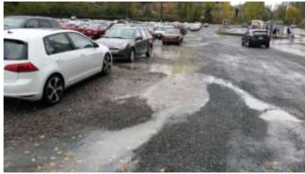
The uneven grade of the site's unpaved surface causes storm water to pool in the numerous gullies in the parking area.

priority on Lincoln Street, and badly-needed drainage and storm-water treatment improvements. Benefits include improved access and safety for pedestrians, bicyclists and people with disabilities, as well as reduced delay on local roads and nearby I-5 interchanges. WTA will apply for a SFY 2019-21 Regional Mobility Grant through WSDOT in the amount of $9,867,971, with the land serving as the required local match. It is requested of the State Legislature that it authorize this request. Request: $9.87-million