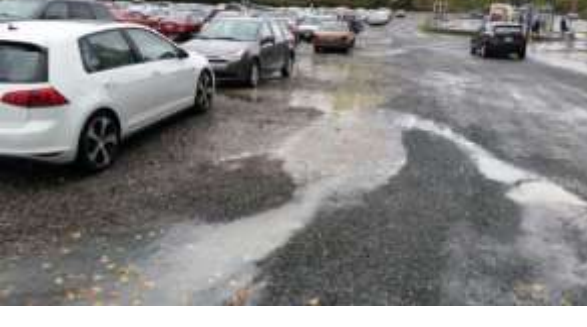
The uneven grade of the site's unpaved surface causes storm water to pool in the numerous gullies in the parking area.

improvements. Benefits include improved access and safety for pedestrians, bicyclists and people with disabilities, as well as reduced delay on local roads and nearby I-5 interchanges. WTA will apply for a SFY 2019-21 Regional Mobility Grant through WSDOT in the amount of $9,867,971, with the land serving as the required local match. It is requested of the State Legislature that it authorize this request.