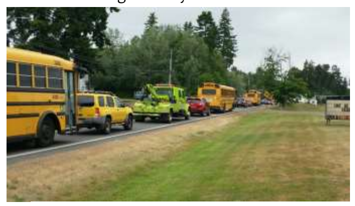
Traffic backed up on State Route 548 due to VACIS inspection.

Grade Separation Rail-Traffic Solution at State Route 548 (Blaine) – The U.S Department of Homeland Security's "VACIS" rail freight-car inspection array is located alongside BNSF Railway's tracks immediately south of the City of Blaine's southern limit. While the VACIS is in operation, freight trains must slow down to a virtual crawl, which has the unintended effect of blocking the busy intersection of Peace Portal Drive and Blaine Road (both of