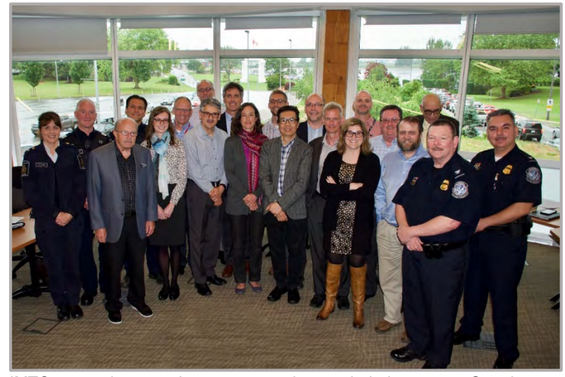
IMTC consortium member representatives at their June, 2017 Steering Committee meeting, CBSA Douglas Port of Entry, Surrey, BC.

WCOG's IMTC consortium partners to identify non-U.S. federal match for NEP initiative funding proposed in this LOI.