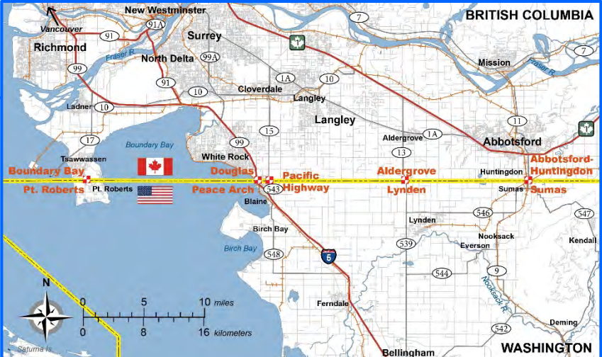
Figure 2: The Cascade Gateway

Figure 1 is a map of the Pacific Northwest / Cascadia megaregion – the chain of urban centers from Portland, Oregon north to Vancouver, British Columbia. This chain of large cities is an agglomeration of dense and growing population centers, increasingly integrated manufacturing and tech-industry sectors, and social and cultural networks. The international freight and travel demand generated in and attracted by the megaregion is served in the broadest terms by highways (most notably U.S. Interstate 5), railroads, marine ports and routes to Asia and beyond, and international airports. Access and mobility in the