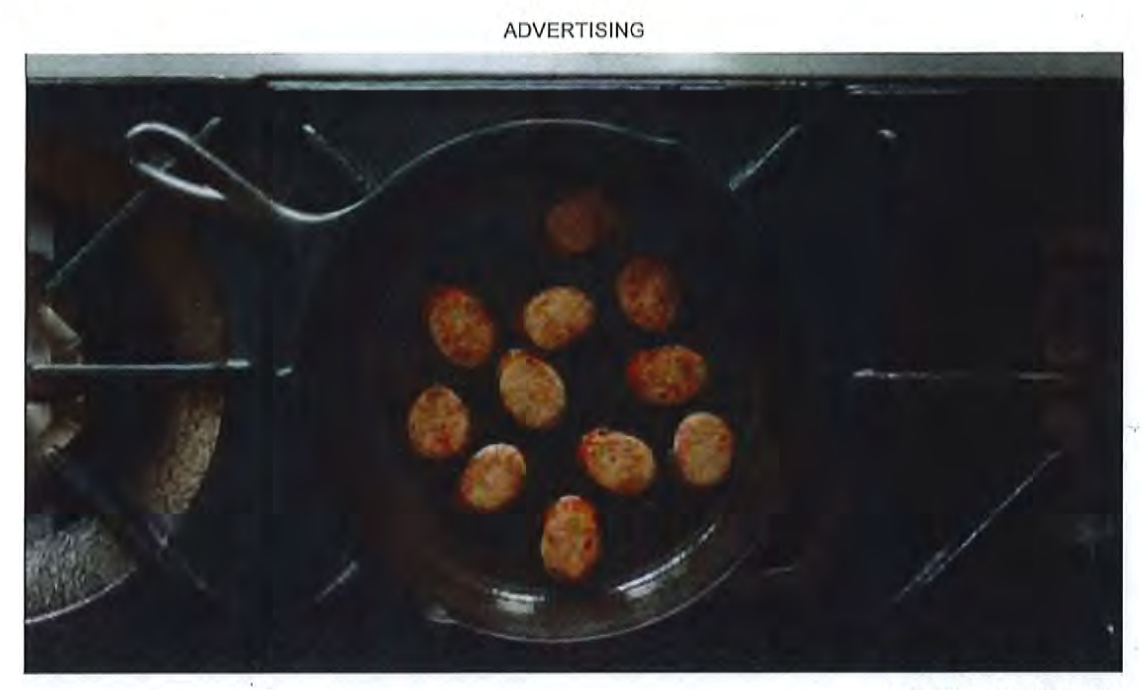
inRead invented by Teads

All you to do is download an app that knows where you've gone for a week and asks a few questions about how you got there — whether it was by car, bus, bike or foot.