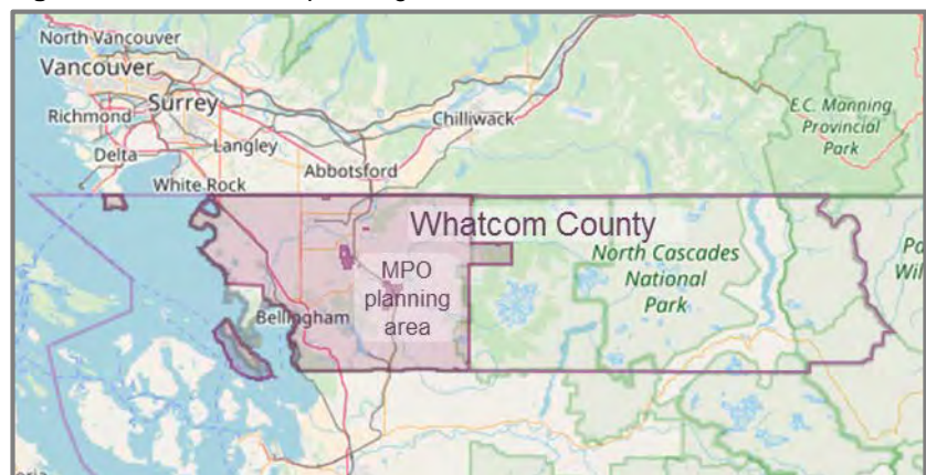
Figure 3: WCOG's MPO planning area

Figure 3 shows Whatcom County, WA with a shaded inset of WCOG's MPO planning area. WCOG's lead agency role for the IMTC Program was established, along with the program itself, in 1997, when both MPOs and border state departments of transportation were eligible to apply for US FHWA assistance under the Coordinated Border Infrastructure (CBI) Program. WCOG was