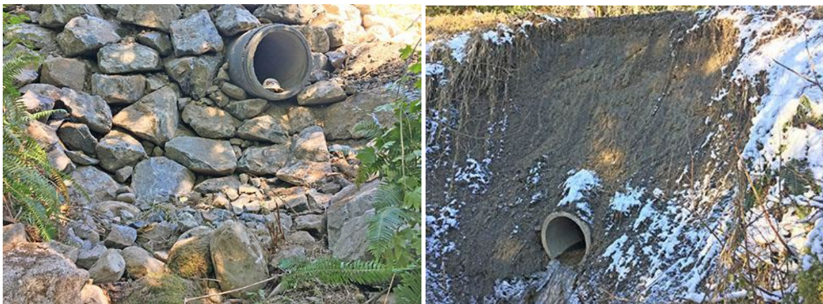
Above left: Photo shows scale of fish barrier at the outlet of the culvert. Above right: Photo shows prior damage when the downstream end of the culvert failed and temporary repairs were made to prevent loss of the roadway.

Mosquito Lake Road/Hutchinson Creek Tributary Fish Passage (Whatcom County) – The existing 30-inch diameter concrete culvert at this location was damaged in early 2018, with a temporary repair made later that year. This culvert has been designated as a high-priority fish passage improvement. Request: $800,000