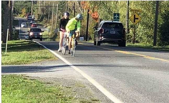
The lack of bike lanes and sidewalks – as well as inadequate or non-existent shoulders – makes bicycling and walking hazardous in many locations along Marine Drive.

Marine Drive Improvements, Phase Two (Whatcom County) – Marine Drive is an important regional corridor for commuters and recreational bicyclists. The roadway parallels the bluff on the north shore of Bellingham Bay from Bellingham and crosses the Nooksack River delta on its way to the Lummi Nation. This project between Locust Avenue and Alderwood Drive is the second of a three-phase project to improve bicycle and pedestrian safety from the Bellingham city limits across the BNSF railway. (Additional information can be found here .) Request: $2.5-million