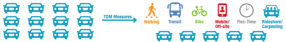
TDM graphic from City of Monterey, CA – monterey.org

In partnership with the Whatcom Transportation Authority (WTA), regional business, local governments, and public agencies, Smart Trips engages with our region’s residents and encourages them to make more of their trips by walking, biking, riding the bus, and sharing rides.