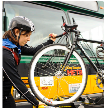
Enhance Multimodal Connections and Choices