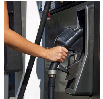
Align Funding Structure with Multimodal Vision