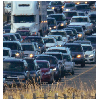
Manage Growth and Traffic Congestion