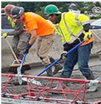
Maintain and Preserve Assets