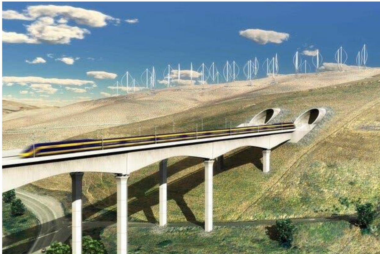
An artist's rendition showing the bullet train passing through Altamont, Calif. Some officials question whether the project will ever be completed.

More political debate ensued over what route the train would take into the San Francisco Bay Area. The existing rail corridor through Altamont Pass, near Livermore, was a logical alternative. The French engineering company Setec Ferroviaire reported that the Altamont route would generate more ridership and have fewer environmental impacts.