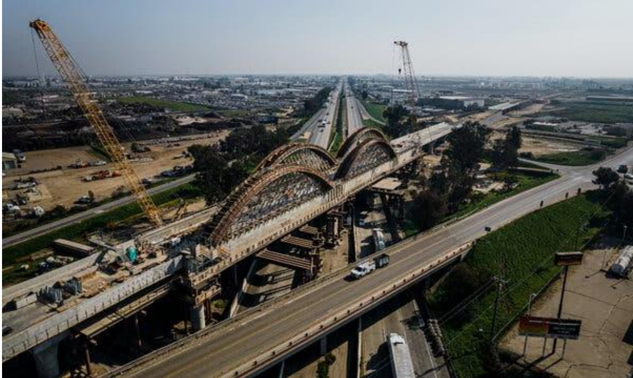
A number of viaducts for the high-speed rail system are in various stages of construction in the Central Valley.

There were plenty of reasons for routing the train through the two desert cities, where more passengers could board, he said, and it was only natural that his constituents would want to see benefits from a bullet train. “We wanted to share all that stuff.”